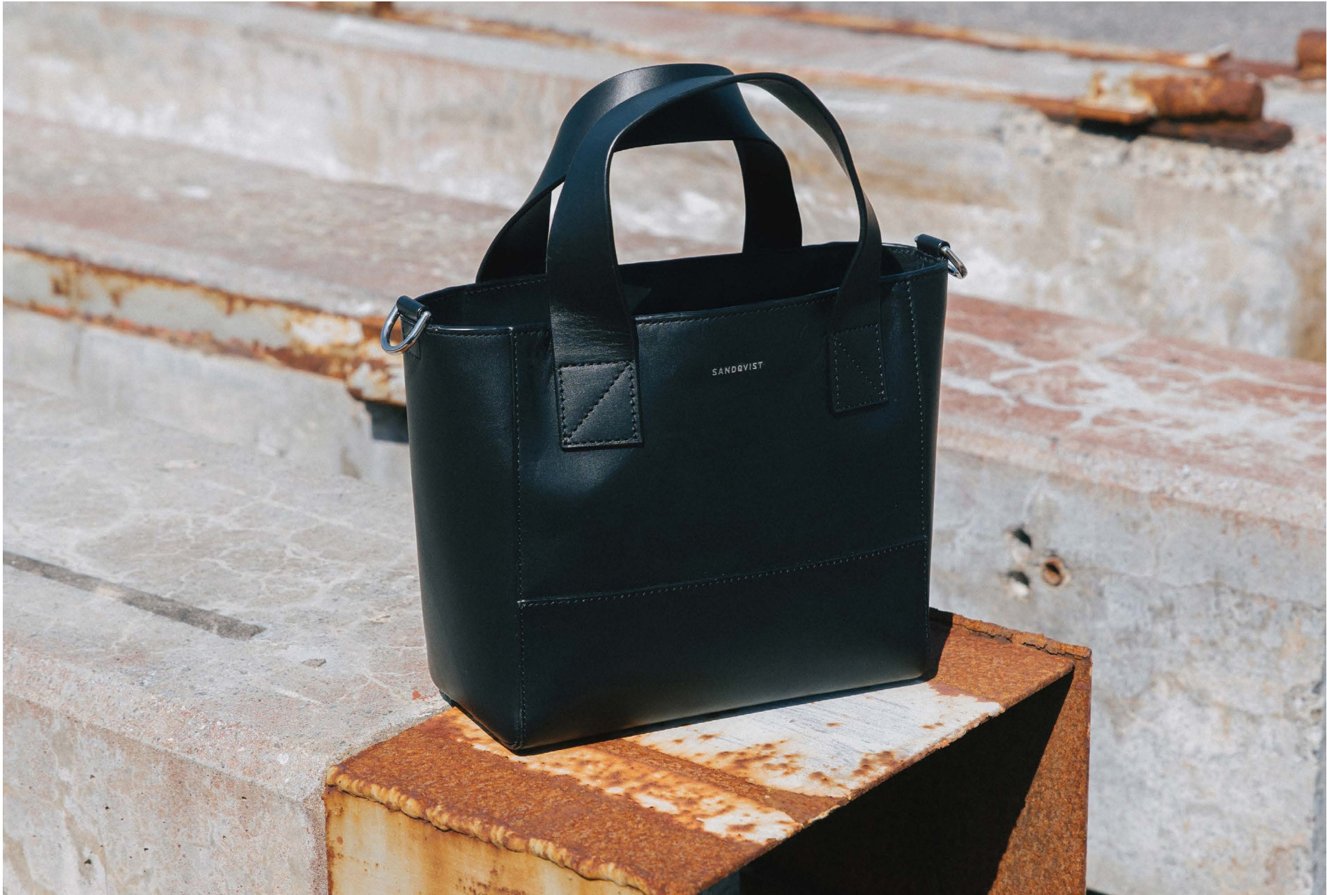
↑ Cecilia, Black