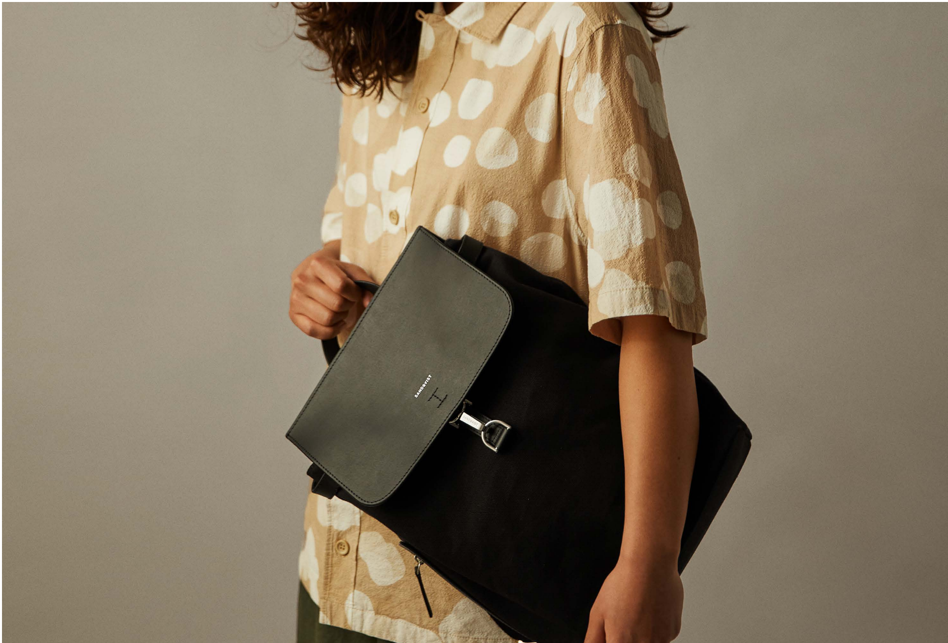
↑ Alva Metal Hook, Black