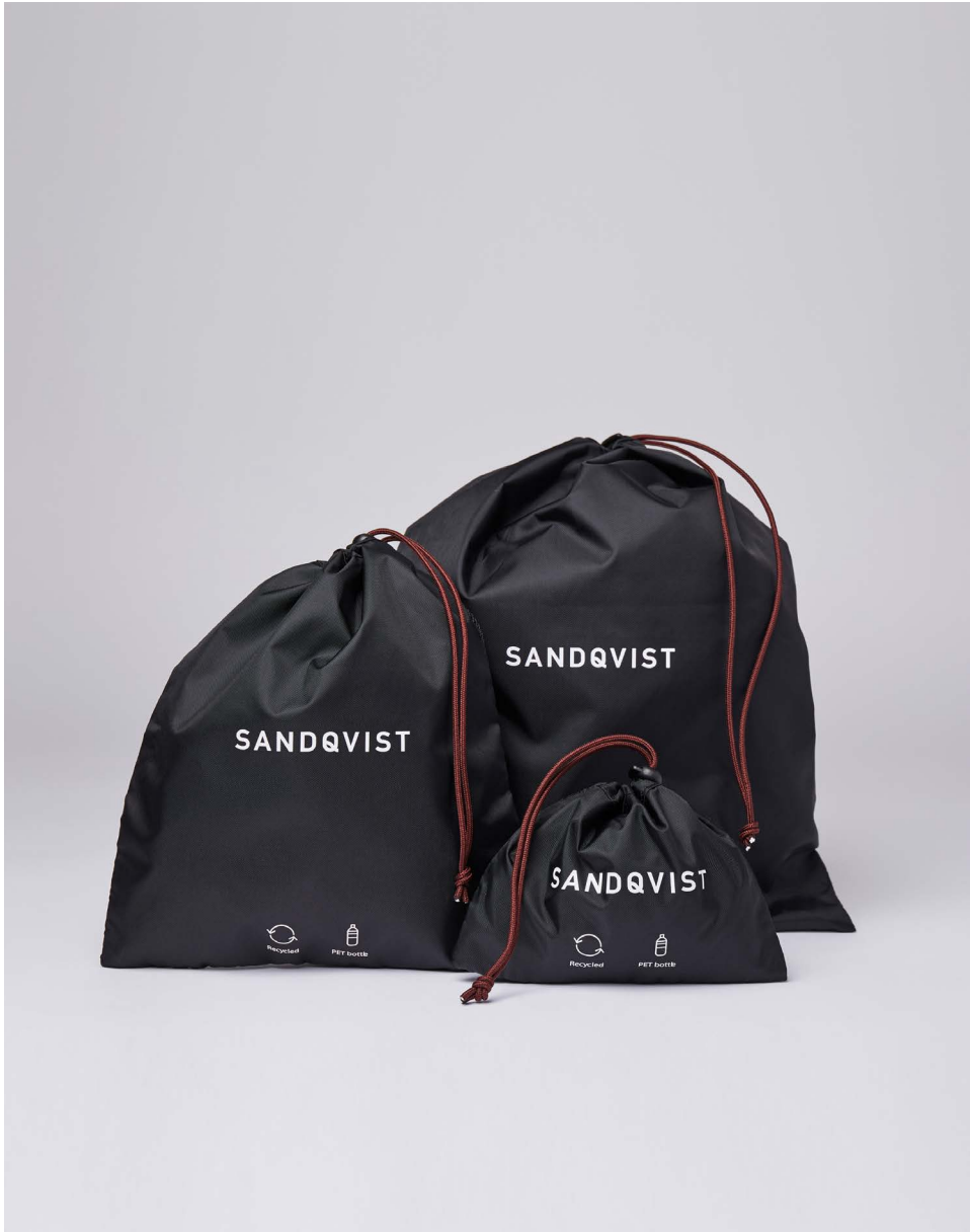
↑ 3 Pack Bag, Black