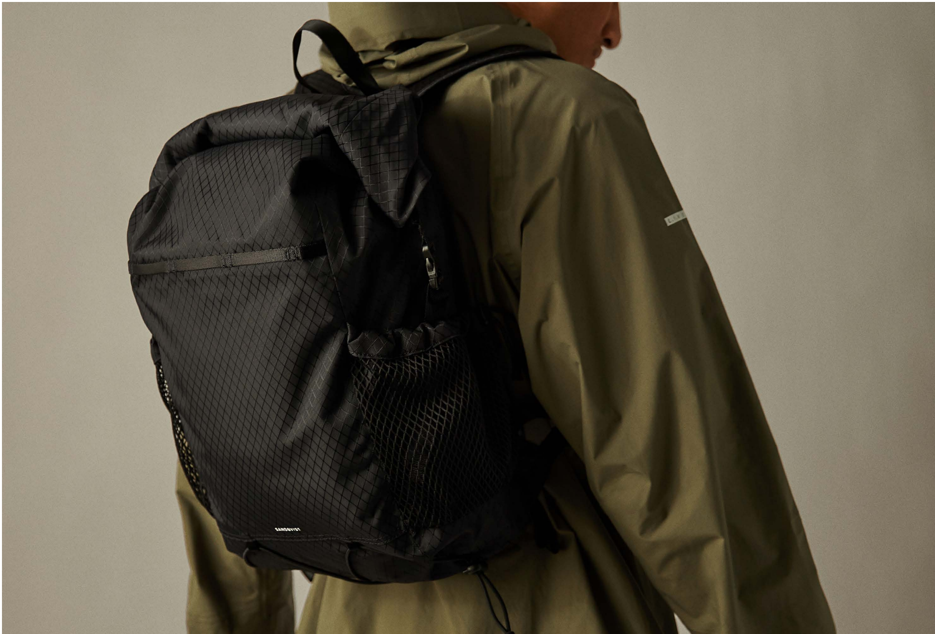
↑ Nils, Black