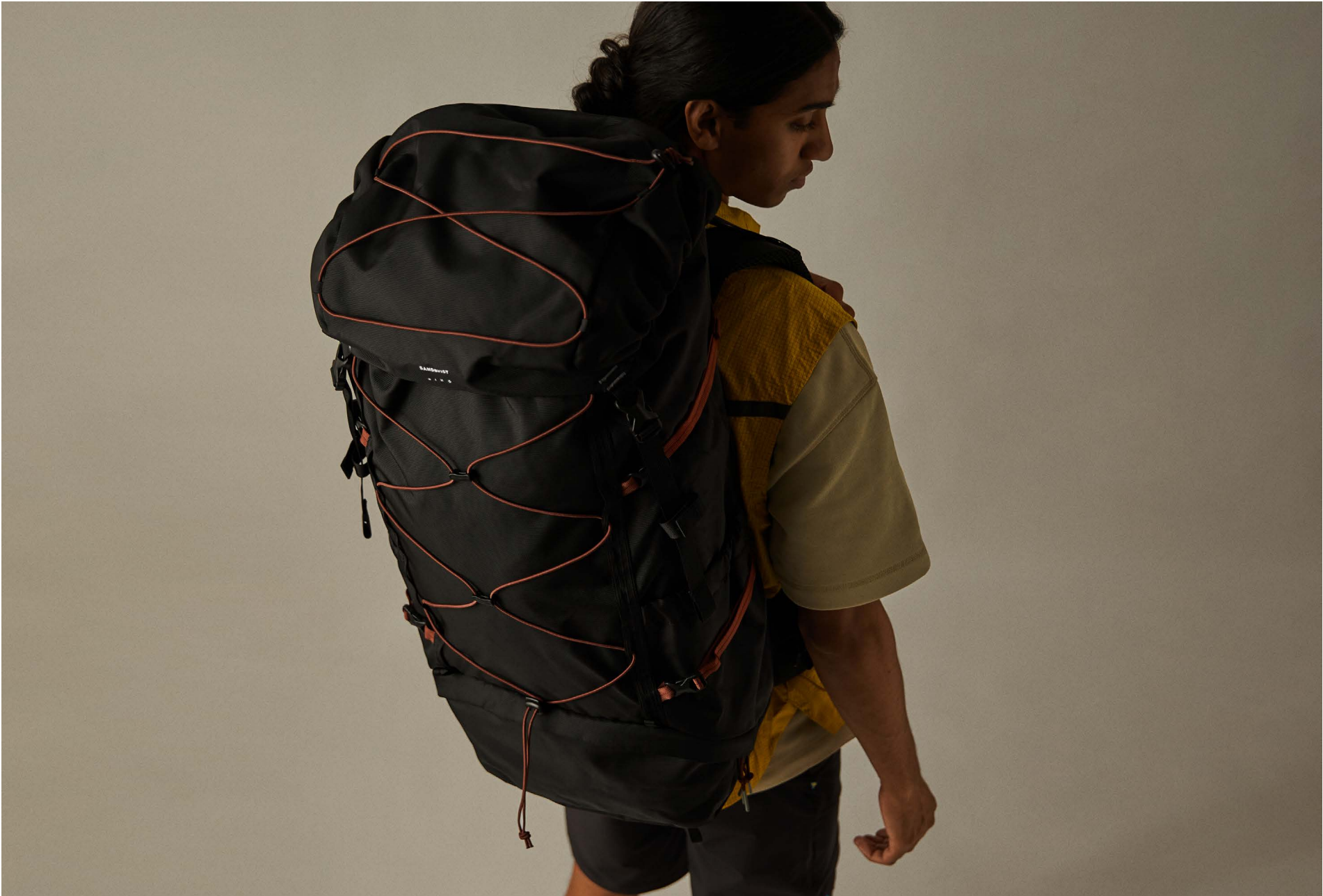
↓ Trail Hike, Black