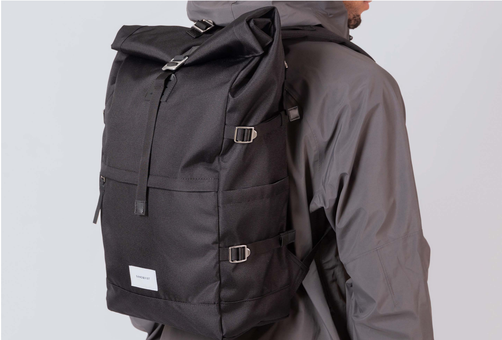
↑ Bernt, Black